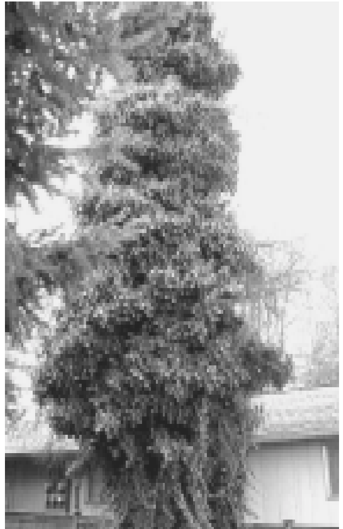
— Score: Ivy 10, tree 0, house ? Tree and house in Bothell